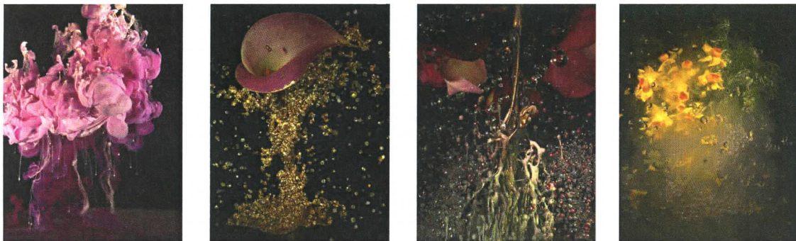
Image (L-R): Oiran , 2014, Video (colour, sound), 5 min 28 sec, 1080 x 1920 pixels, Space Flower , 2014, Video (colour, sound), 6 min 12 sec, 1080 x 1920 pixels, Space Jungle , 2014, Video (colour, sound), 5 min 33 sec, 1080 x 1920 pixels, Moon Flower , 2014, Video (colour, sound), 5 min 24 sec, 1080 x 1920 pixels