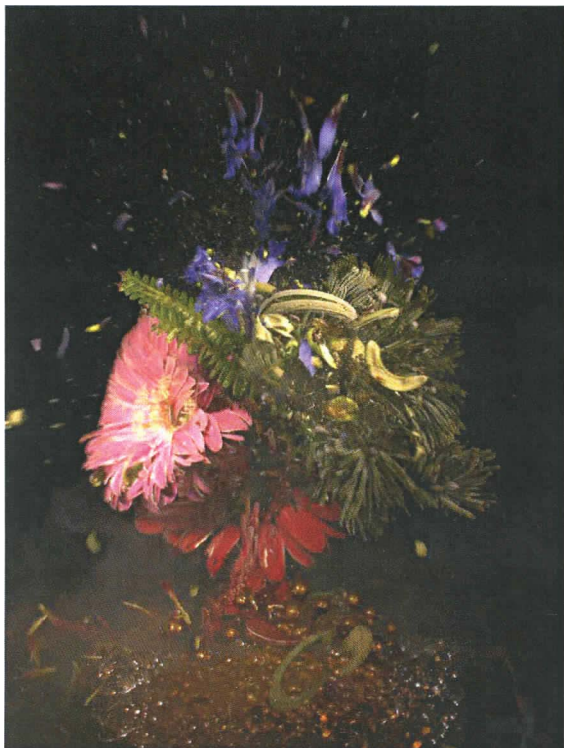
Image: Space Jungle , 2014, Video (colour, sound), 5 min 33 sec, 1080 x 1920 pixels