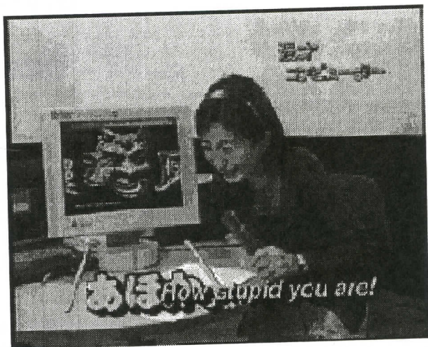
Figure 1. Interactive Comedy System

the dialogue of two Manzai comedians. The two comedians play the role of "Boke" and "Tsukkomi." Boke plays a role of an ordinary person who expresses his/her everyday opinions. Sometimes these opinions are surface and boring and far from reality. Tsukkomi plays a role of a sensitive person who is keen to detect these opinions and becomes offensive to Boke. Boke shrinks from the opinions of Tsukkomi but sometimes becomes waked up to the reality. For the conversation between Boke and Tsukkomi, such factors as voice tone, timing, and speech are the keys as well as the conversation content. When these factors are well controlled, the audience is fascinated and involved into the conversation. They want to become Manzai comedians by themselves.